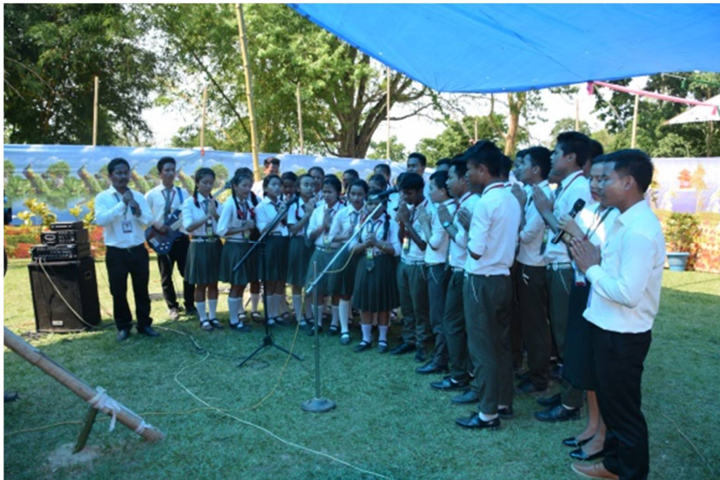
Prayer Song by school children