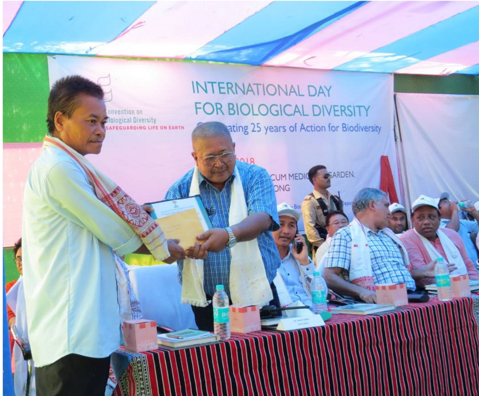
Representative of Parkup Pahar BMC receiving Certificate and start-up grant from Special PCCF, Karbi Anglong