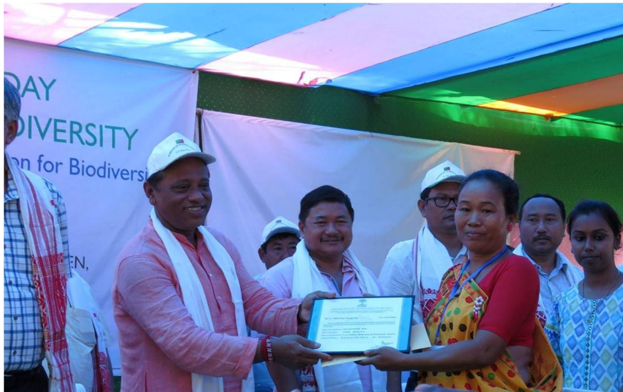
Representative of Rangapahar BMC receiving Certificate and start-up grant from Hon'ble Minister ( E& F), Assam

Certificates and start-up grant was given to the 10 (ten) Biodiversity Management Committees of Karbi Anglong district by the Dignitaries present on the dais.