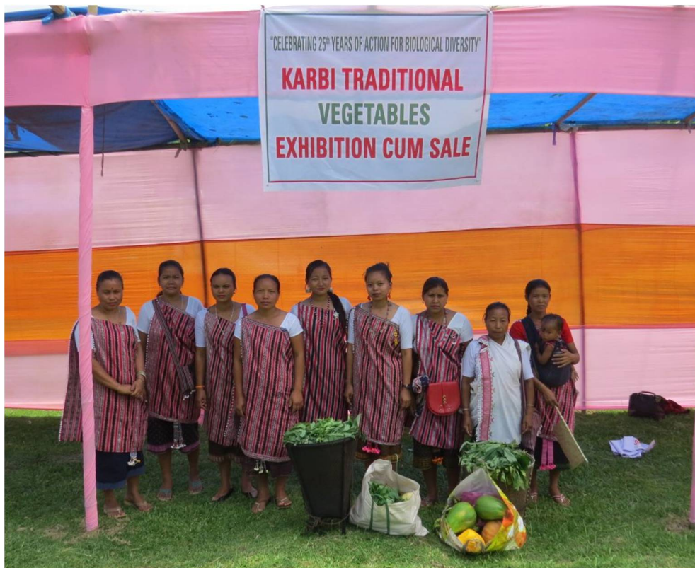
Local vegetables for exhibition by Ladies of Chingrum Self-Help Group