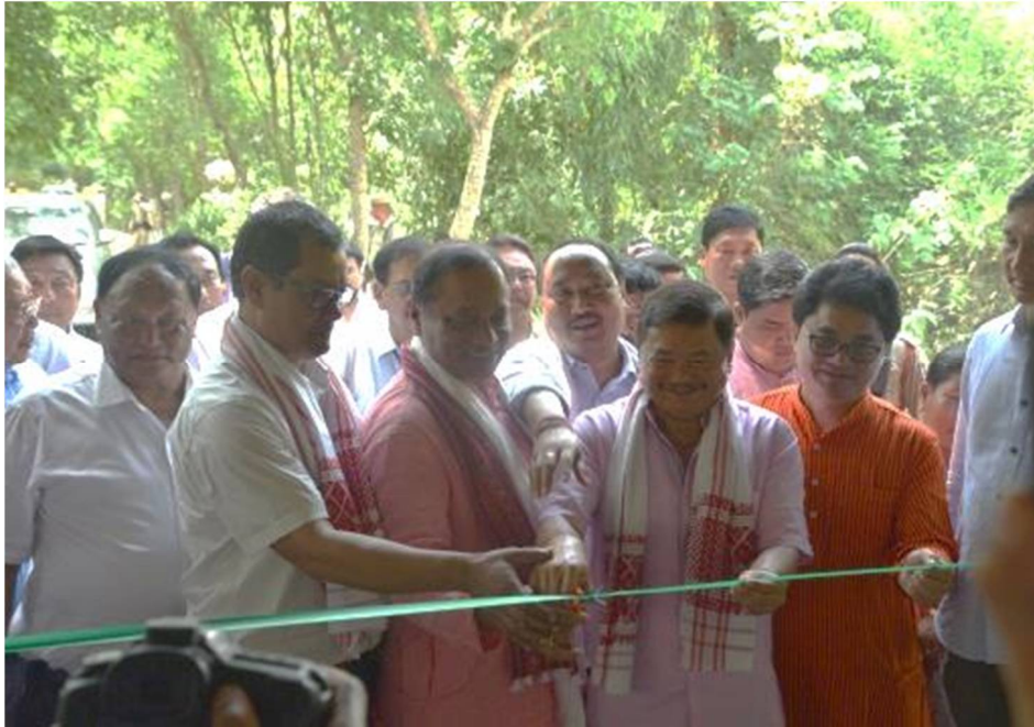
Inaugural of exhibition