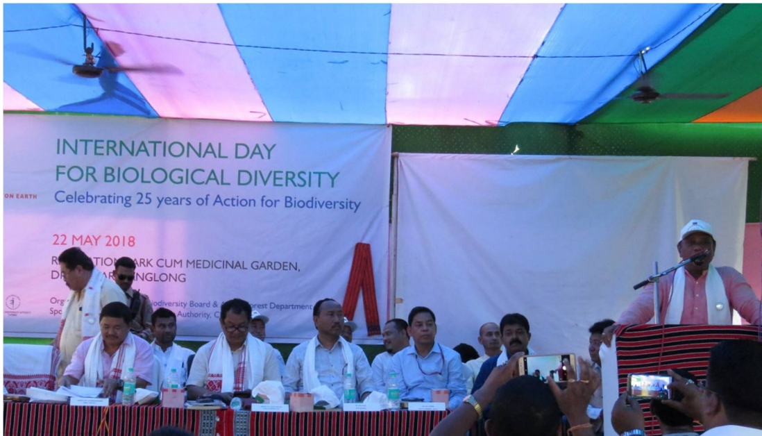
Address by Chief Guest Shri Parimal Suklabaidya, Hon'ble Minister (E &F), Assam