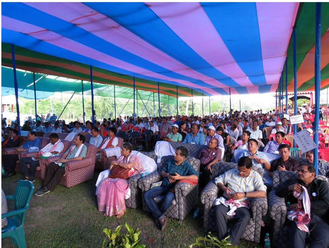
Senior Forest Officials, Invited Guests, BMCs members and others present in the function

In addition, Representatives of Educational Institutions, Members of Biodiversity Management Committees, school children and local people also attended the function.