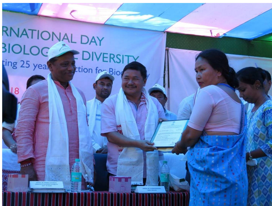
Representative of Langpher BMC receiving Certificate and start-up grant from Hon'ble CEM, KAAC