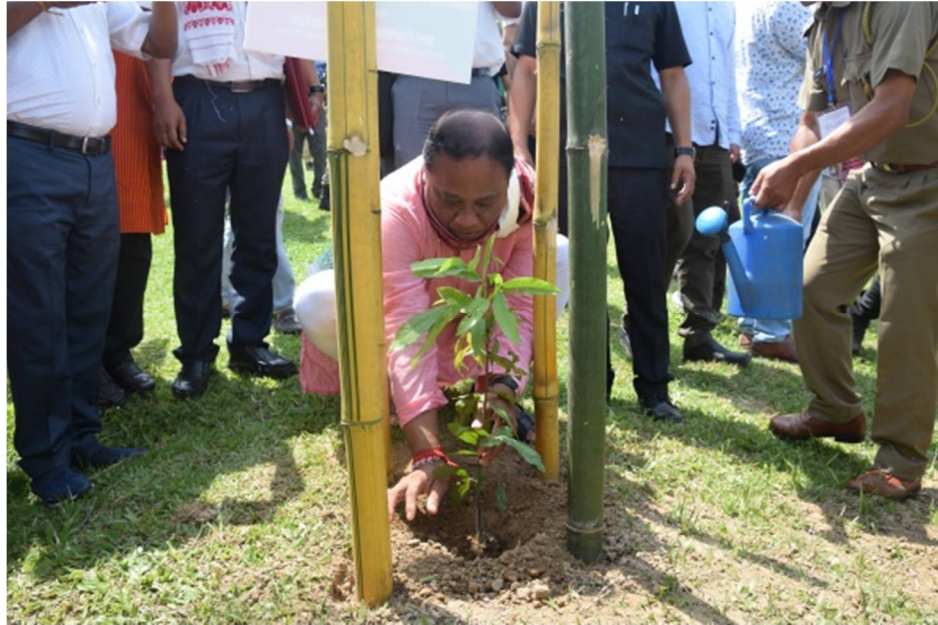
Plantation by Hon'ble Minister (E & F), Assam