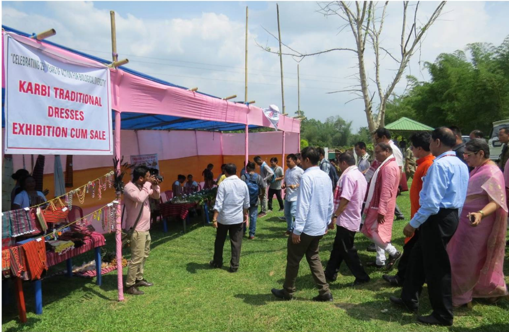
Exhibition of Traditional Karbi Dress and local vegetables by Self-Help Groups