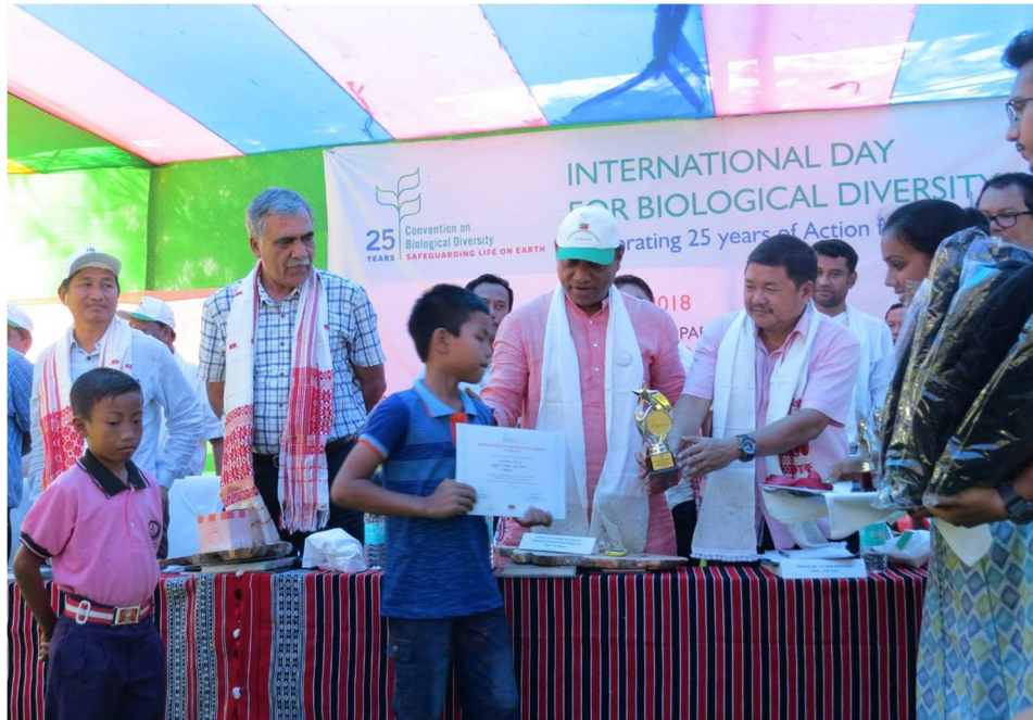
Students receiving certificates and prizes from Dignitaries