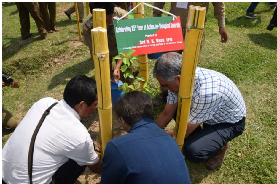
Plantation by PCCF & HoFF, Assam