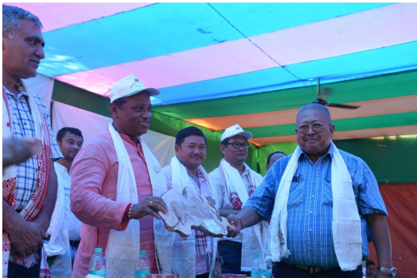
Special PCCF, Karbi Anglong presenting memento to Hon'ble Minister ( E & F), Assam

Shri N. K. Vasu, IFS, Principal Chief Conservator of Forests & Head of Forests Force, Assam, Chief Guests of the function- Shri Parimal Suklabaidya, Hon'ble Minister, Environment & Forests, Government of Assam, and Shri Tuliram Ronghang, Hon'ble Chief Executive Member (CEM), Karbi Anglong Autonomous Council (KAAC) also addressed everyone present in the function and delivered their speech on conservation significance of biodiversity.