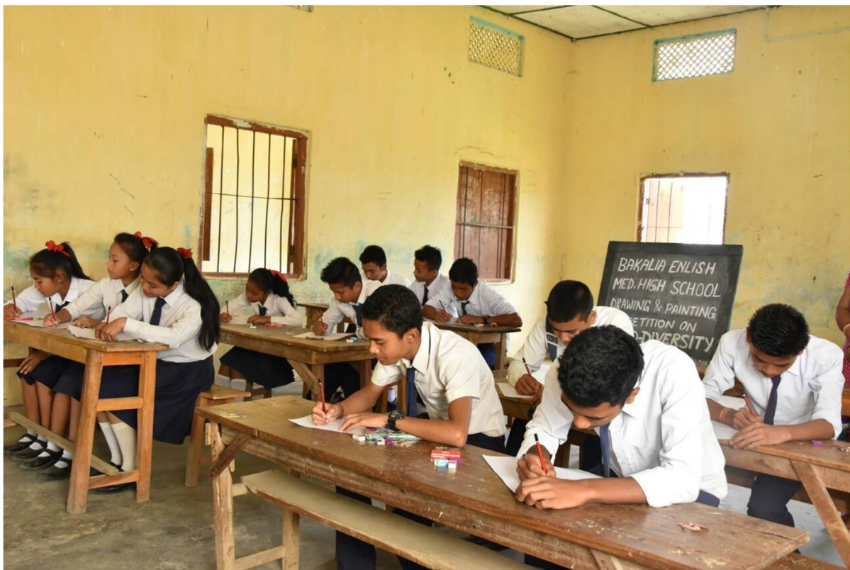
Students from various schools taking part in competitive events