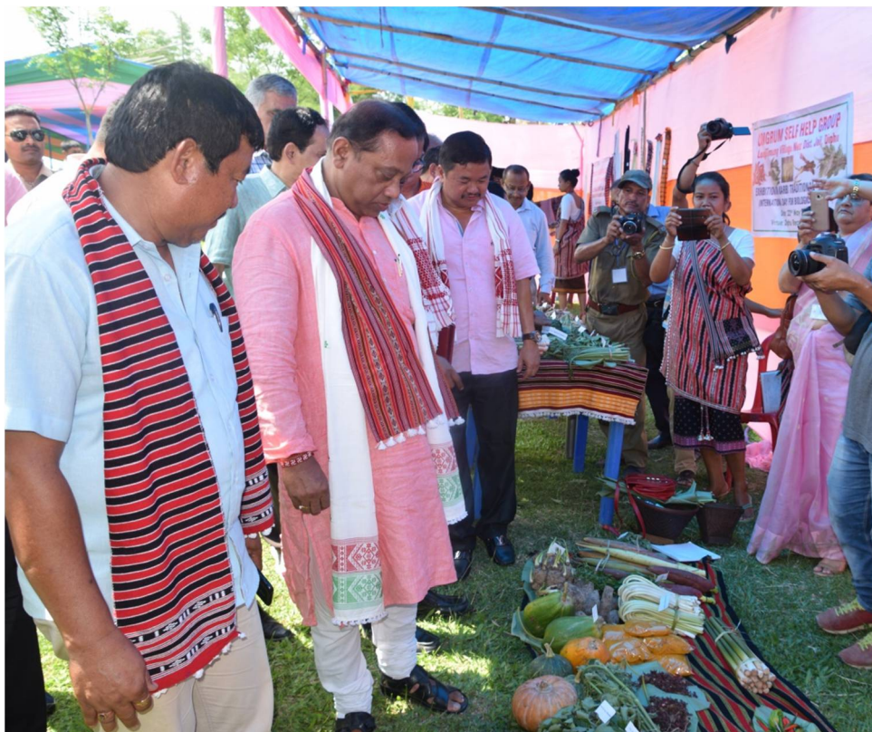
Dignitaries giving a look at the exhibition by Self-Help Groups

10. Seedling distribution: The program ended with free distribution of saplings to the local people and students.