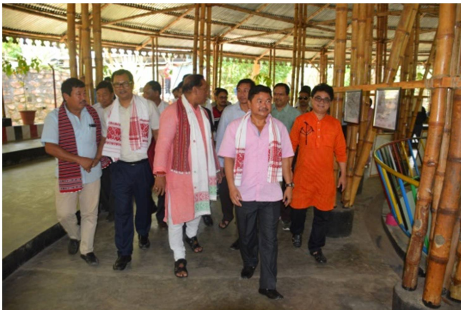
Dignitaries at the exhibition