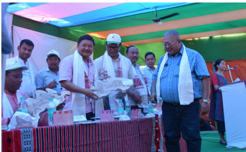
Special PCCF, Karbi Anglong presenting memento to Hon'ble CEM, KAAC