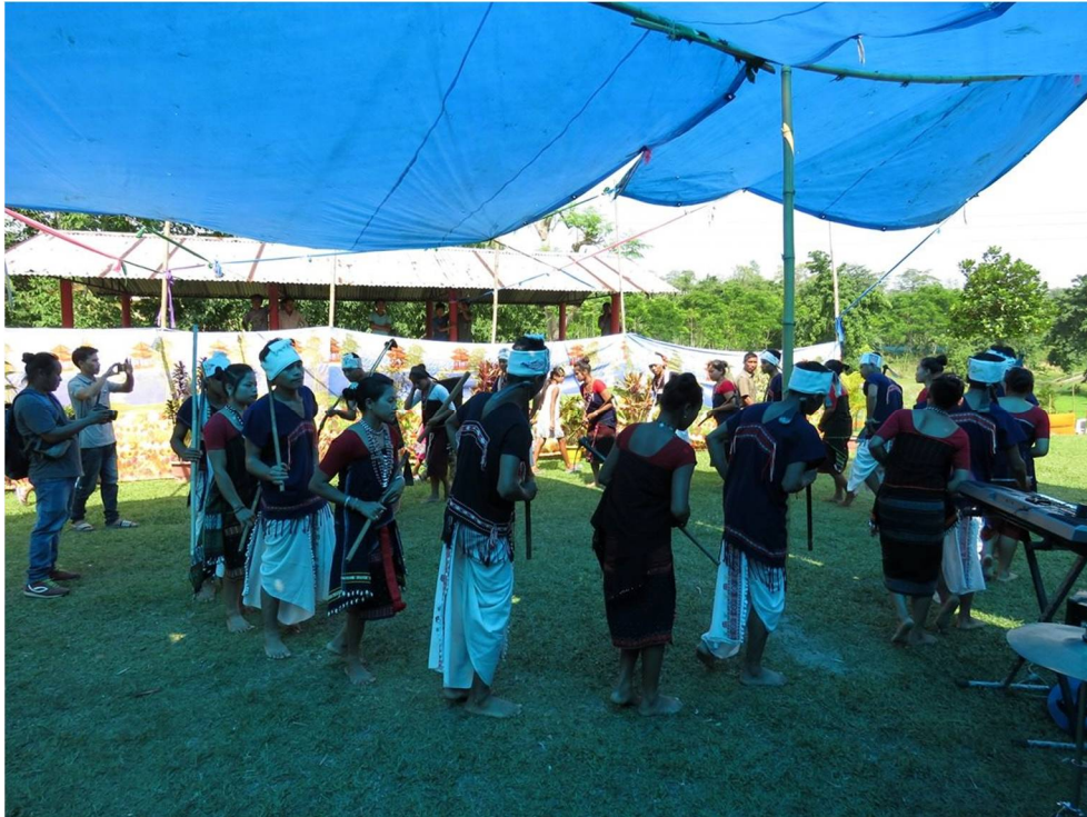
Karbi Dance Performance